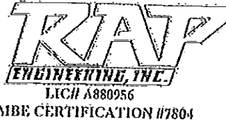
EXHIBIT 1 - LETTER OF ASSENT